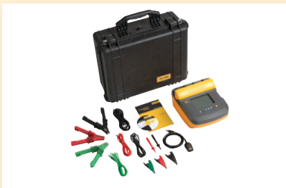
Fluke 1555 Insulation Resistance Tester Kit