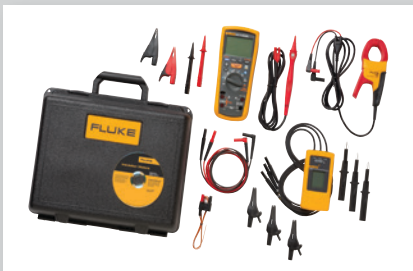
MDT Advanced Motor and Drive Troubleshooting Kit