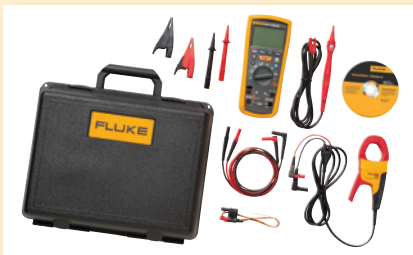
Fluke 1587 FC ET Advanced Electrical Troubleshooting Kit