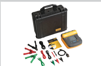
Fluke 1550C Insulation Resistance Tester Kit